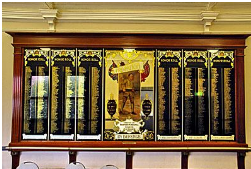
Redfern Town Hall Honour Roll